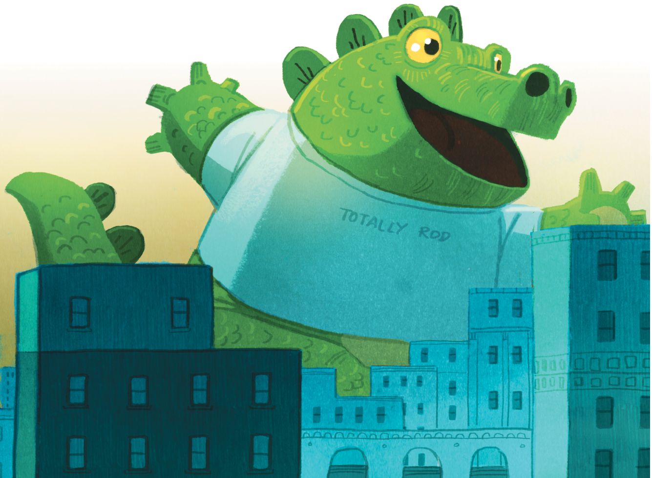
ILLUSTRATION © DAN SANTAT

We will be tearing through the picture book RODZILLA by Rob Sanders and illustrated by Dan Santat (Simon & Schuster).